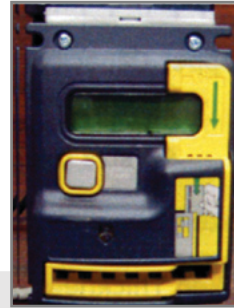
MEI@ Combo Bill and Card Acceptor