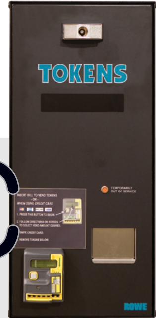
Century 6 Front Loader