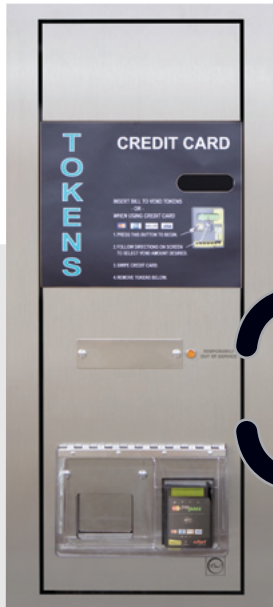
Century 10 Rear Loader